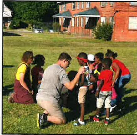
SCORE International AL Trip