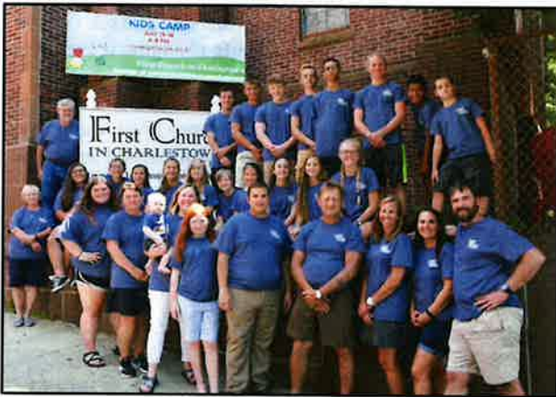
Boston Mission Team 2019

The next upcoming event we promote is The Care Center Walk For Life. This will be at the Dayton office on Main Street and the nearby walking track on Saturday, September 14th at 9:00am. Please consider being a part of this fundraiser for the center, either as a sponsored walker or by financially supporting someone who is. This is a great opportunity each year to show your support for the work and ministry of The Care Center, as well as the sanctity of life!